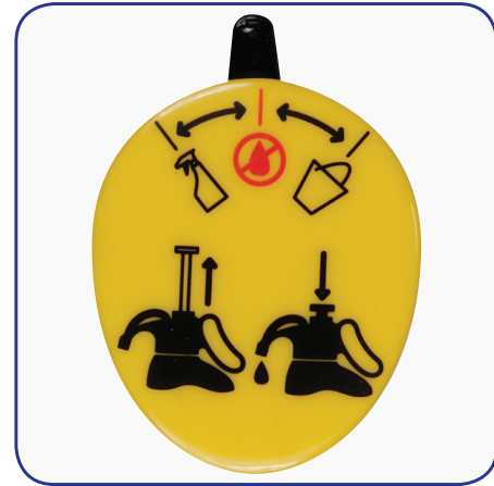
Control knob with easy-to-understand icons.