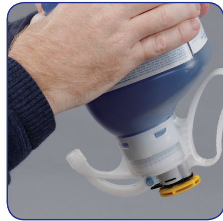
Patented Spill-Tite sonically-welded head eliminates leaking of concentrate.